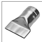
Item No. 4031 Wide slot nozzle 70 x 4 mm