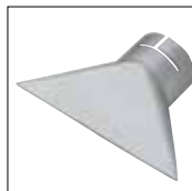
Item No. 4021 Wide slot nozzle 150 x 1