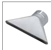
Item No. 4022 Wide slot nozzle 150 x 10