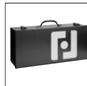
Item No. 7012 Metal case