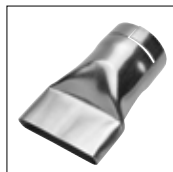
Item No. 4030 Wide slot nozzle 70 x 10 mm